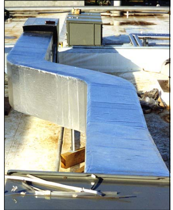
Houston, TX 2008

The ALUMAGUARD, ALUMAGUARD LT All Weather and ALUMAGUARD LITE family of products give owners, specifiers and contractors premium products for any type of project.