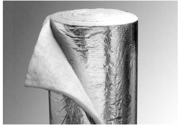
Operating Temperature Limits: 40°F to 250°F (4°C to 121°C) Faced